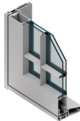
Series 7900s Hinged Right - Swing Out Door