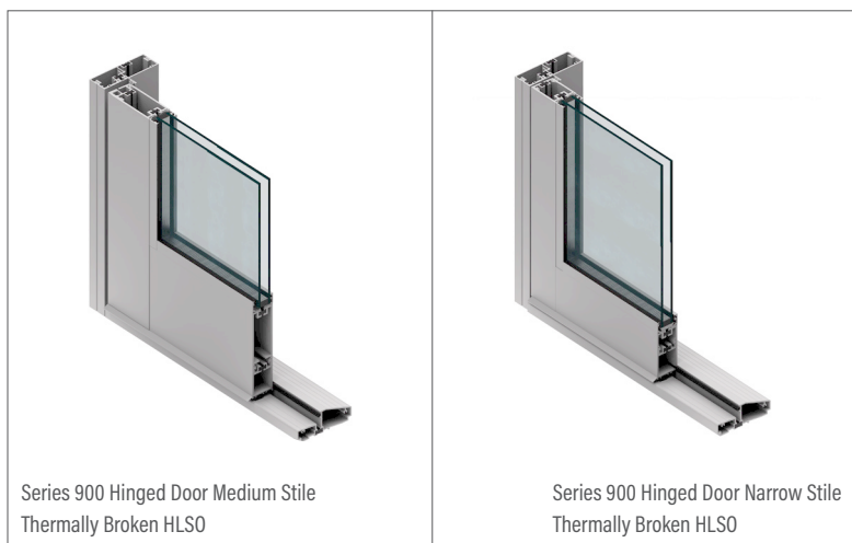
Series 900 Hinged Door Medium Stile Thermally Broken HLSO

Actual values may vary depending on product specifications and configuration. *Glass Makeup = 1" OA E366/Argon/Clear